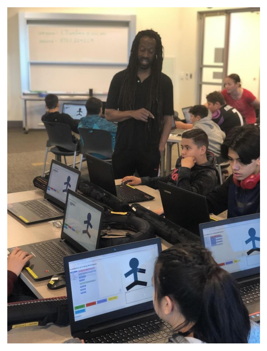
Figure 1. Two team members working with students

In the summer camp, students designed a costume, with separate EL wires in each appendage, which are also controlled via the code they design in Blockly. Like the puppets, the costumes are controlled using a WiFi DC dimmer, but instead of controlling six individually hued wires, each channel controls a single wire representing each body part. The students are asked to bring dark colored clothing, which they use as their costume base. Each is given six pieces of EL wire and six pieces of mesh that they can thread the EL wire through in a design pattern that they choose before attaching the mesh to the appropriate part of their costume. Students then design a lighting sequence and choreograph dancing using Blockly. They may then combine their choreography and lighting for a group dance with shared lighting effects that may appear to create motion or other effects.