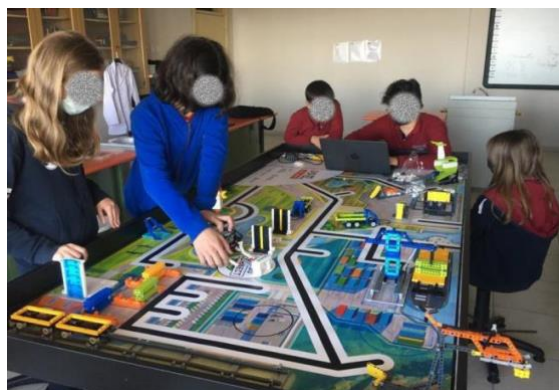
Figure 3. A view from the coding and design tasks

Some students were more focused on interacting with the robot and assembling the parts, showing less interest in coding. Their comments indicated a preference for creating new solutions by altering the robot's components and experimenting through trial and error. The evaluations of the students are illustrated in Figure 3.