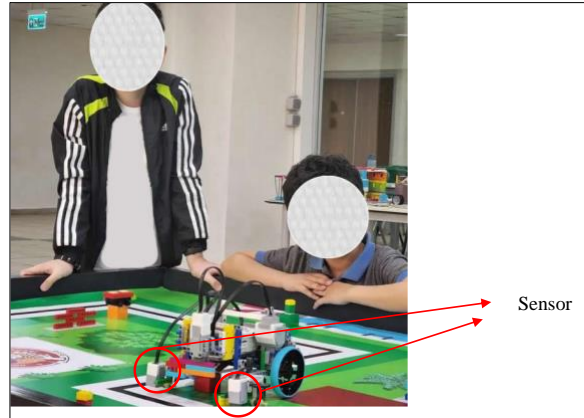
Figure 2. A view from students exploring new solutions using sensors.

In the context of innovative ideas, students modified the codes related to the sensors, achieving the robot's final goal (the task outlined in Activity 2) by proposing new projects that incorporated different sensors attached to the robot. Another theme related to creativity was the Change of the Mission, which was further divided into two dimensions: coding and design. When asked, “Do you want to change the task?” students' responses were categorized under the theme of mission change. The perspectives were presented in Table 4.