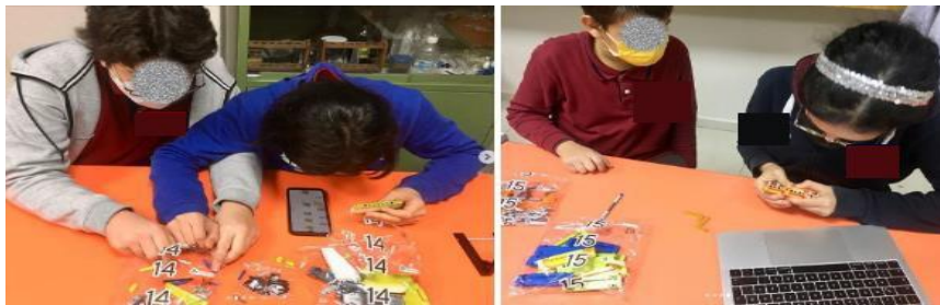
Figure 1. A view from designing additional parts

Regarding the design, S1 stated: "If we change the design of the robot, we can design an additional arm", and S3 expressed: "A long arm can be added". Some other students pointed out the size of the code which was used to activate the robot. For example, S2 expressed that "I think if we use repetition blocks, we can solve more shortly", and S4 expressed that "We should utilize various code blocks for solution". Figure 1 shows a view of the design configuration in Activity 1.