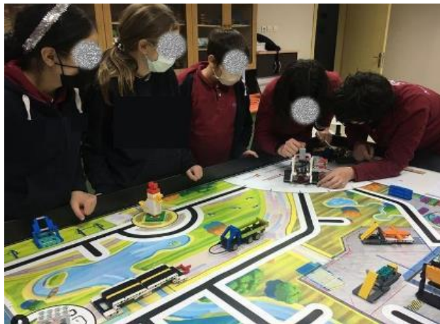
Figure 4. A view from the students considering the detailing

Regarding design, students noted, "The detail of the attachment designed is very important because many features must be considered for the robot to function," and "I paid more attention to the details in the design because coding is ineffective without proper design." These expressions indicate that students recognized the significance of writing accurate code, assembling components, and viewing the robot as an integrated system. They understood that thinking through their tasks in detail would aid in successfully completing them. Students considering the detailing are shown in Figure 4.