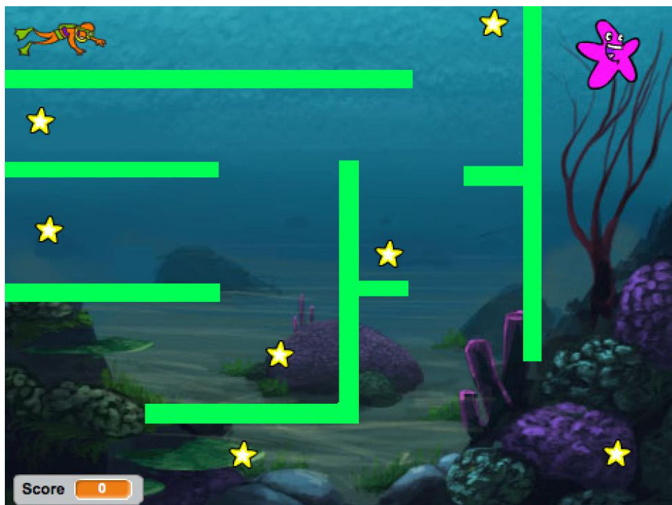
Figure 2. Screen Shot of the Scratch Maze Game Used In Questions 8-11

Participants received one point for each star collected and three for completing the maze. If they touched the maze walls, they were sent back to the beginning of the program. There were seven separate bugs in the Scratch script, which it was anticipated that the participants would have the ability to identify.