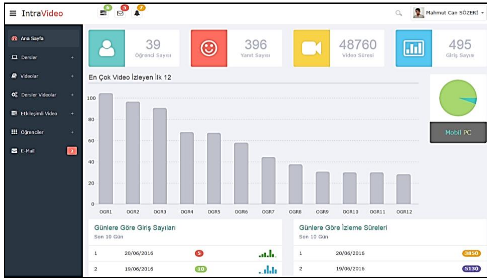
Figure 4. IVS Management Homepage

The management panel of IVS is the administration section of the system. A view of the IVS management panel is presented in Figure 4.